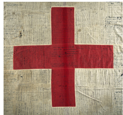
Red Cross flag, 1915, featuring more than 500 signatures of stretcher bearer Harry Baily's comrades. Purchased with the assistance of the Department of Veterans' Affairs, 2001.