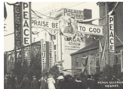
Peace celebrations, Hobart, 1919.

To download images, visit the Media section at http://www1exhibition.tmag.tas.gov.au .