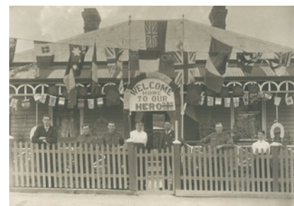
Burge family house in Burnett Street North Hobart on return of sons from WWI, c.1919.